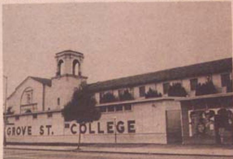
This is the much needed, much loved North Peralta Community College that the Peralta Board of Trustees has seen fit to "phase out."

The fight to save "Grove Street College" has been going on since 1971. Last year, Oakland's Planning Commission recommended that the Grove Street site be