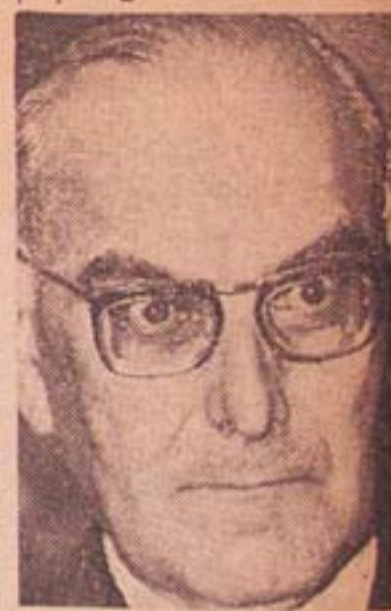
Portuguese Premier MARCELLO CAETANO.

The paper was vague on what specific policy should be adopted, talking only of "a political solution that safeguards national honor and dignity but which takes into account the incontestable and irreversible reality of the deep aspirations of the African people." □