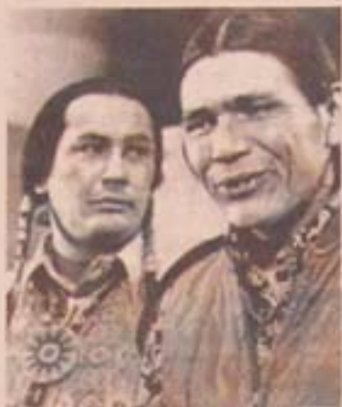
RUSSELL MEANS (left) and DENNIS BANKS are on trial for the Wounded Knee occupation.