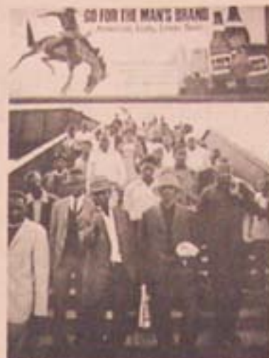
Workers descend from train station on way to work in Johannesburg, South Africa.