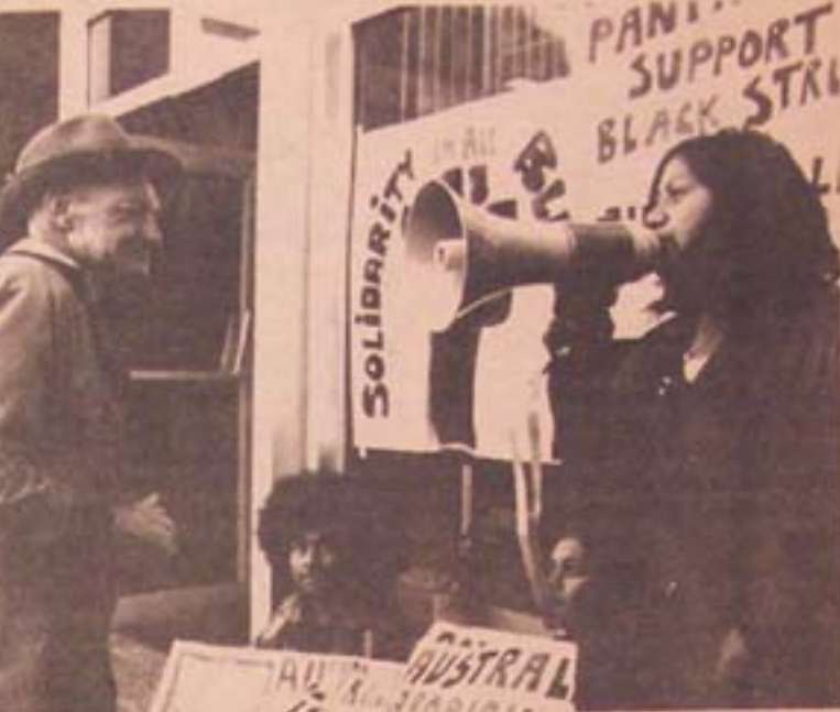
Polynesian Panthers demonstrating solidarity with struggle of Australian Aborigines before the Australian embassy in Auckland, New Zealand.

(Panama Canal Zone) - Perhaps the only outcome that can be assured from the recent talks between the embattled President of Panama, Brig. Gen. Omar Torriko Herrera and U.S. Secretary of State Henry Kissinger, is