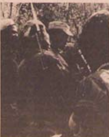
MPLA guerrillas fight to free Angola.

"The MPLA hereby states that with the inevitable independence of Angola all these companies which operate off-shore or inland will be chased from our national territory and all their equipment and assets seized.