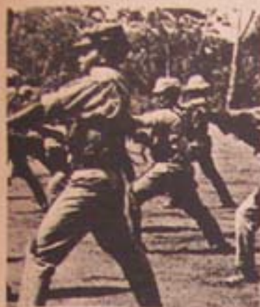
Women of Mozambique have taken up arms to struggle for national independence.