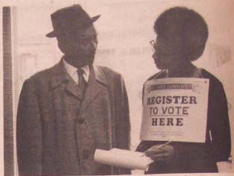
Oakland resident discussing his voter registration.