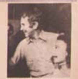
MEMBER OF THE JUDICIARY COMMITTEE