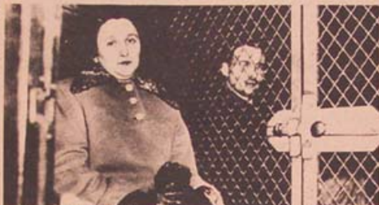
JULIUS and ETHEL ROSENBERG, victims of the "Red Scare" hysteria of the early 1950s.

Julius and Ethel Rosenberg (in reply to President Eisenhower's offer to "confess" days before they were executed)