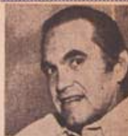
MEMBER OF THE JUDICIARY COMMITTEE