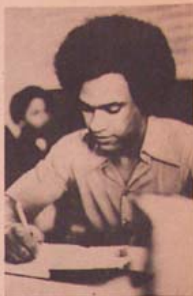
Brother HUEY P. NEWTON

NEWTON: As a matter of fact, that's a very good statement