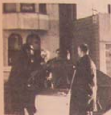
U.S. citizens face daily harassment by police.

The dispute arose over charges by Black and Spanish-surnamed students that the college administration practiced racial discrimination in awarding financial assistance and in other aspects of college operation. ☐