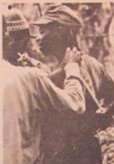
Mozambique freedom fighters in rare moment of rest.

Other guerrilla units are reportedly preparing widespread infiltration and sabotage in Cabinda. Last autumn President Mobutu of Zaire ordered the removal of White Portuguese from Zaire's borders with Angola and Cabinda for "security reasons." The move was widely interpreted