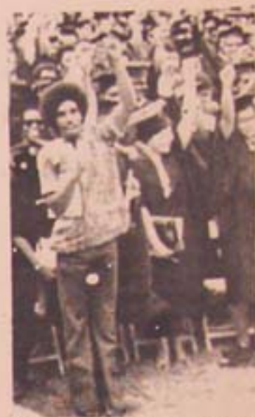
U.S. college students protest aid cutbacks.

In spite of all the attempts to convince us that cutbacks are good for us, from the government's Committee on Economic