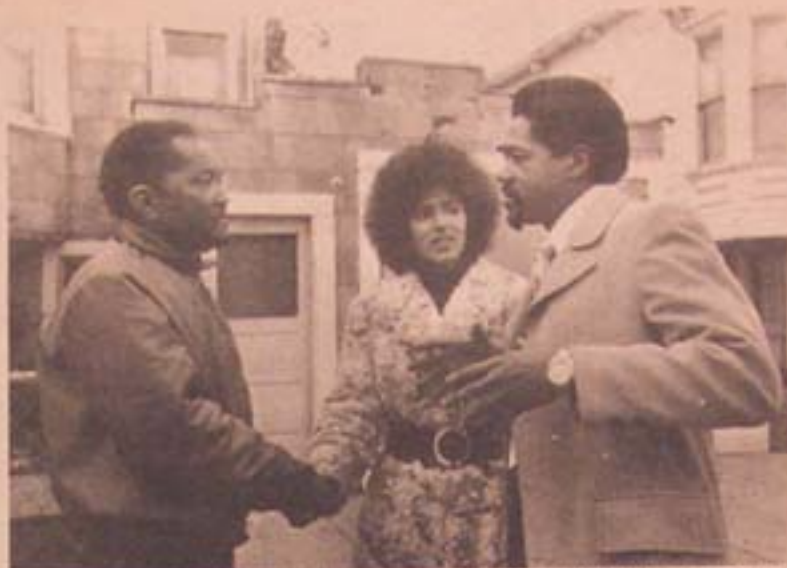
During recent Oakland election, Sister ELAINE BROWN and Brother BOBBY SEALE [right] took their campaign directly to the people.

"Get up and muster some energy if you feel like it. Stand up! Feel like you need to impeach Nixon and kick Nixon out of office.