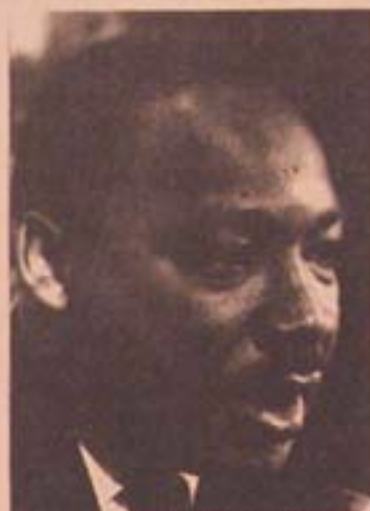
DR. MARTIN L. KING, JR.

"Brother Martin Luther King and Malcolm X were trying to tell us something. Martin said, 'I've been to the mountaintop.' And while he was trying to tell you that he had been to the moun-